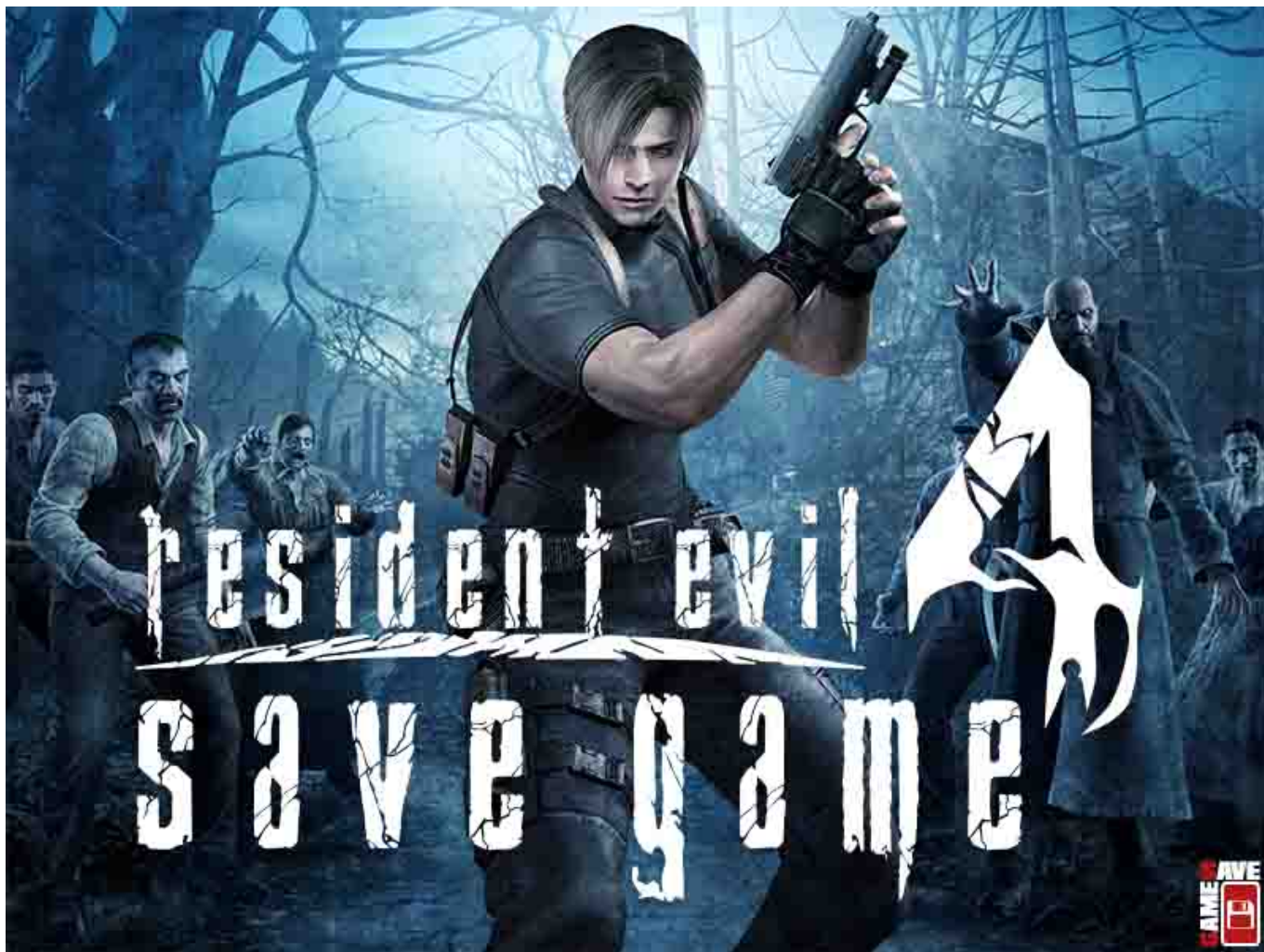
Resident Evil HD Remaster [FitGirl Repack] Latest Version